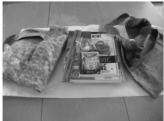
School bags which were taken along to the gathering.